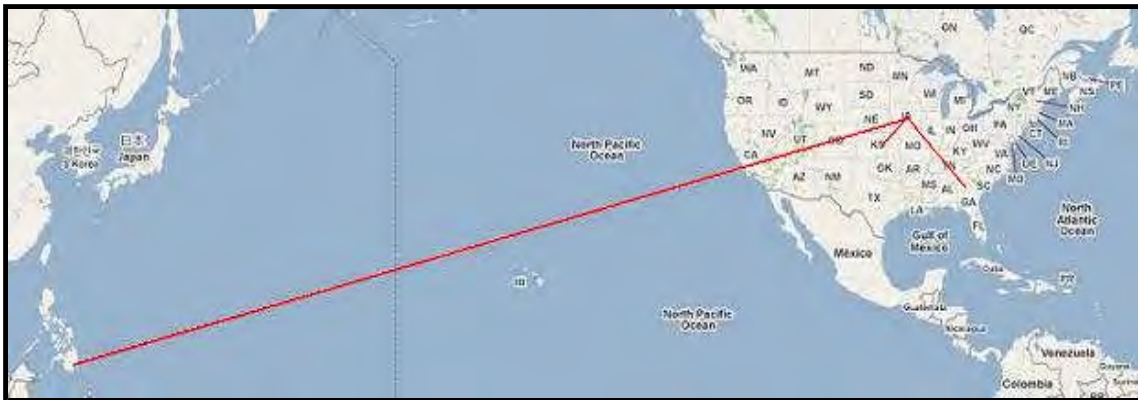
Phoning in from our four Heart Sounds International locations